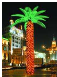
4,50 or 6 or 7,50