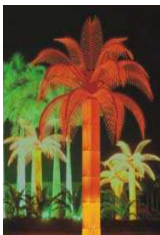
6, or 7,50 mt