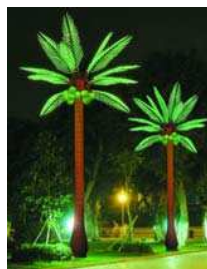
4, or 6, or 7,50 mt